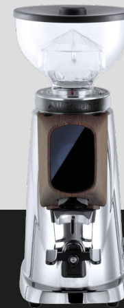
Chrome Plated & Rovere Old