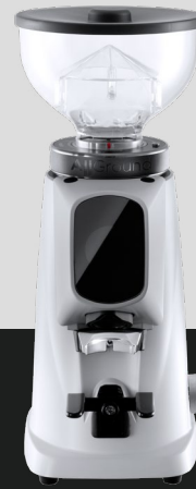
Artic White Matt