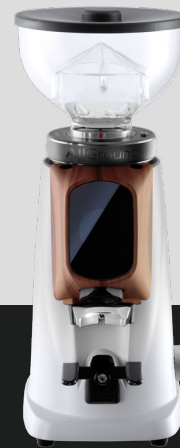
Artic White & Walnut