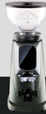
Sage & Satin Silver