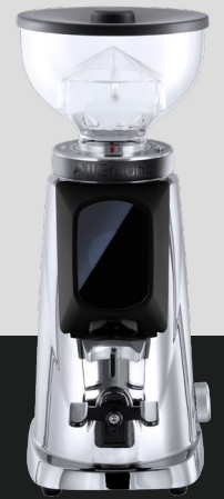
Chrome Plated & Deep Black